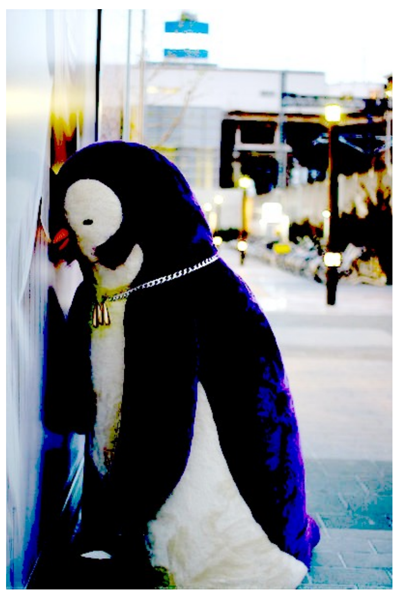
A penguin overcome by the overwhelming pain and angst of its cursed existence...