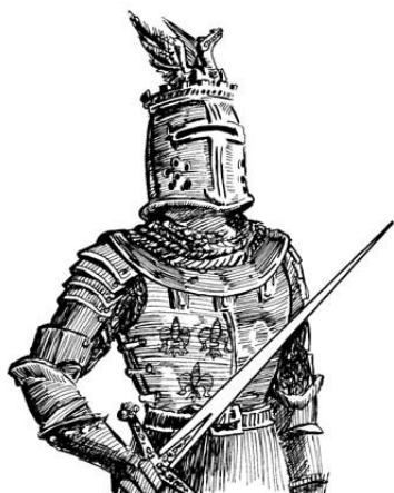
Plate armor: Armor Rating 5, 100 coins