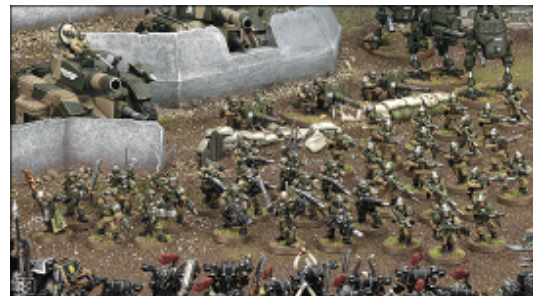
Above: An entire army of Imperial Guard groups alongside a team of Player Characters before an oncoming attack by Chaos Space Marines.

In the coming months, you will find new books containing entire armies, selectable for war using this RPG system. Look for more weapons, too; coming very soon.