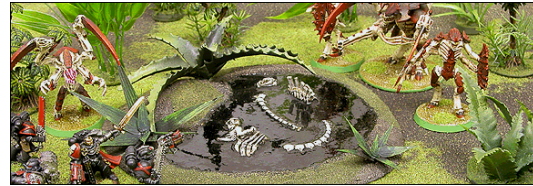
Above: A Brood of Tyranids search for a team of Player Characters (Space Marines) in the jungles of a lost world.