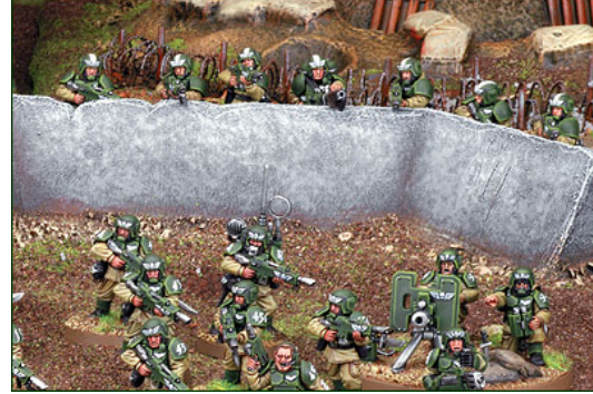
Above: Armies of Imperial Guard alongside a team of Player Characters hold off an oncoming invasion.

complete when trying to hold off an army of Tyranids, even when you are being assisted by other squads in the scenario or storyline you would be playing with.