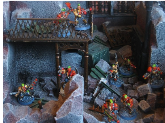
Above: Rival Gang, the Raging Furies lying in wait for the Bloody Scars. This battle was gruesome, and the Bloody Scars captured Dragoul into their captivity.