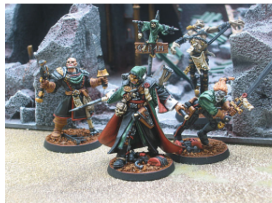
Above: Inquisitor Asphixious waits for the Bloody Scars with his own back-ups.